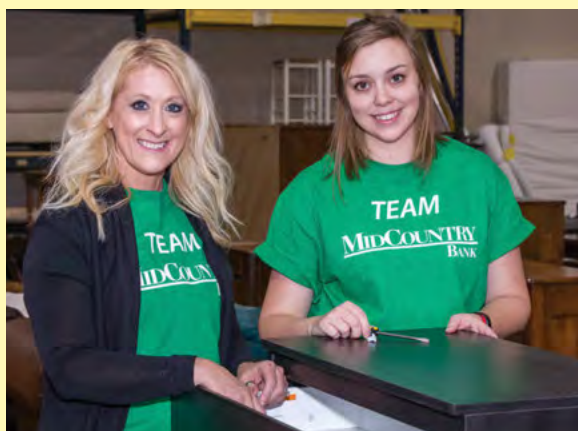
Employees from MidCountry Bank helped assemble dressers in December 2019.

We often have groups ask us about volunteering, but space constraints and regular volunteers' schedules limit our ability to accommodate large numbers of people. While the furniture warehouse has added room for businesses and civic organizations to volunteer, we are not always able to find special activities for them.